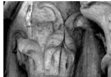
Orbais ES1ne(a) by Lazare