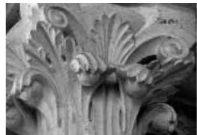
Orbais EC2s(a) by Franck