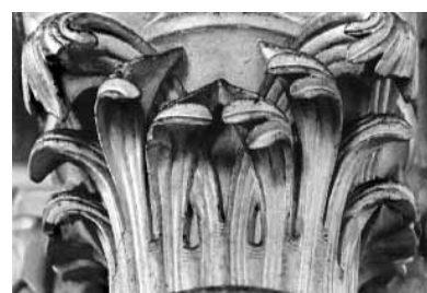
Laon gallery NE3s by Serge