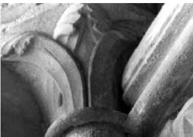
Orbais A2c by Serge