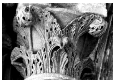
Nouvion north by Adrien

Strap designs were carved by five masters, but I am not sure which one received the Recognition This was around 1163, just after Auguste had been working in the gallery at Laon [b1]. The others are unique, and one in particular has an especially well considered layout, but never repeated [b2]. The other capitals were all small in window reveals [next page].