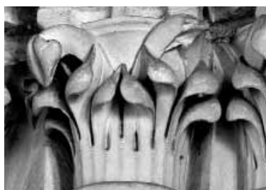
Laon gallery NE3se by Lazare