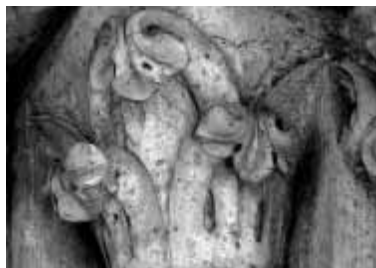
Orbais ES1nen(a) by Eugène