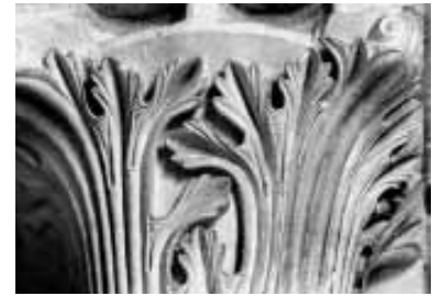
Laon gallery ES3e by Dominique