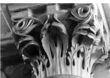
Laon gallery ES6w by Franck