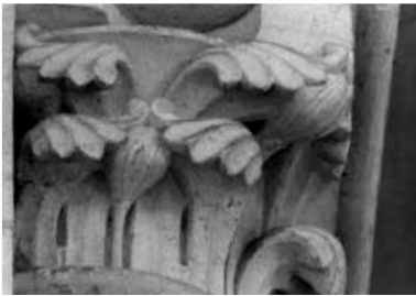
Orbais E3s(a) by Fabrice