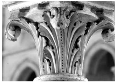
Laon gallery EN2+ by Damien